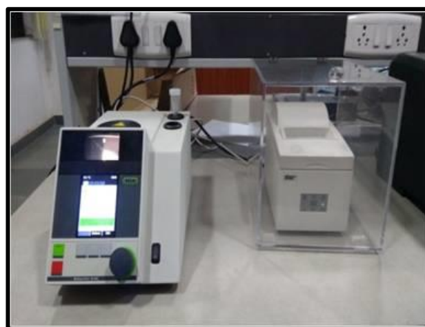
BUCHI Automated melting point apparatus