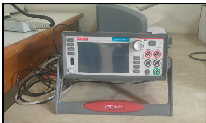
Keithley Source Meter 2450