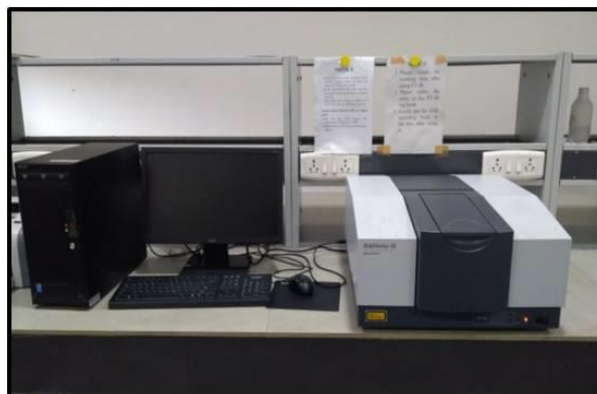
FT-IR Spectrophotometer ATR