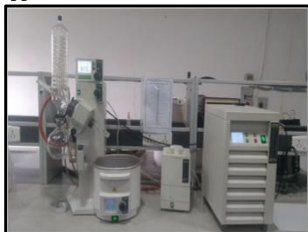
Buchi Rotaory Evaporator